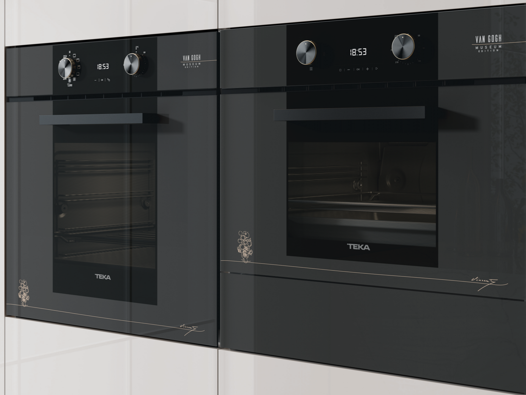
OVENS AND MICROWAVES